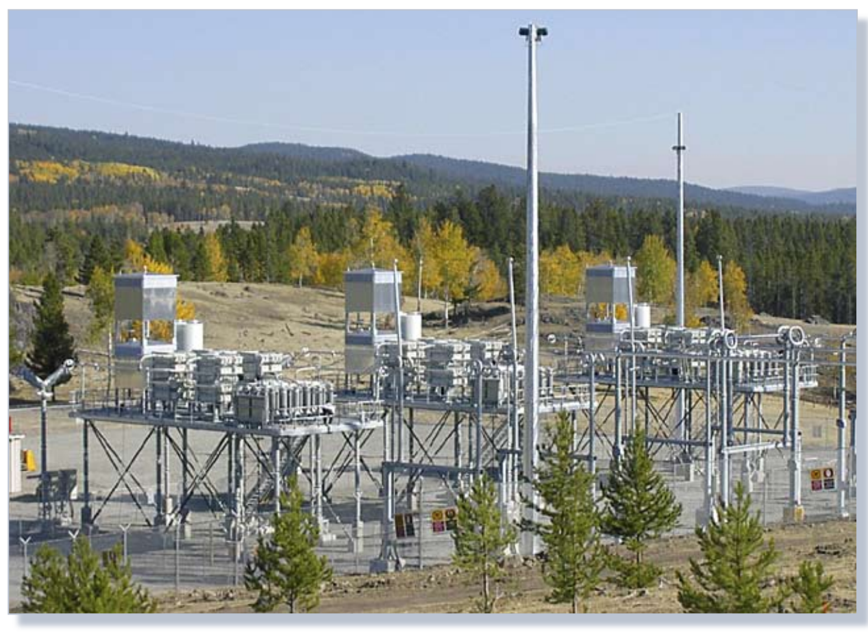
420 Mvar, 500 kV, 2400 A, Guichon, B.C.Hydro, Canada

In all cases the customers have been very satisfied with the proof that the Series Capacitor delivered meets the exact specifications of what the customer has ordered. The verification done through the type tests is the way of ensuring that each Series Capacitor delivered is of the highest quality.