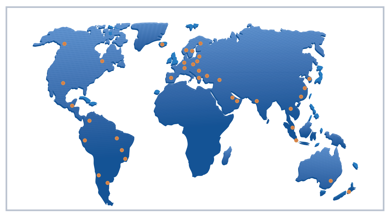
Nokian Capacitors of Finland, has delivered compensation equipment and Series Capacitors all around the world for more than 50 years, always taking local requirements into account.

The company has been a pioneer in developing and implementing the solid-state electronics, fibre optic signal transmission, and non-linear resistor schemes for Series Capacitors.