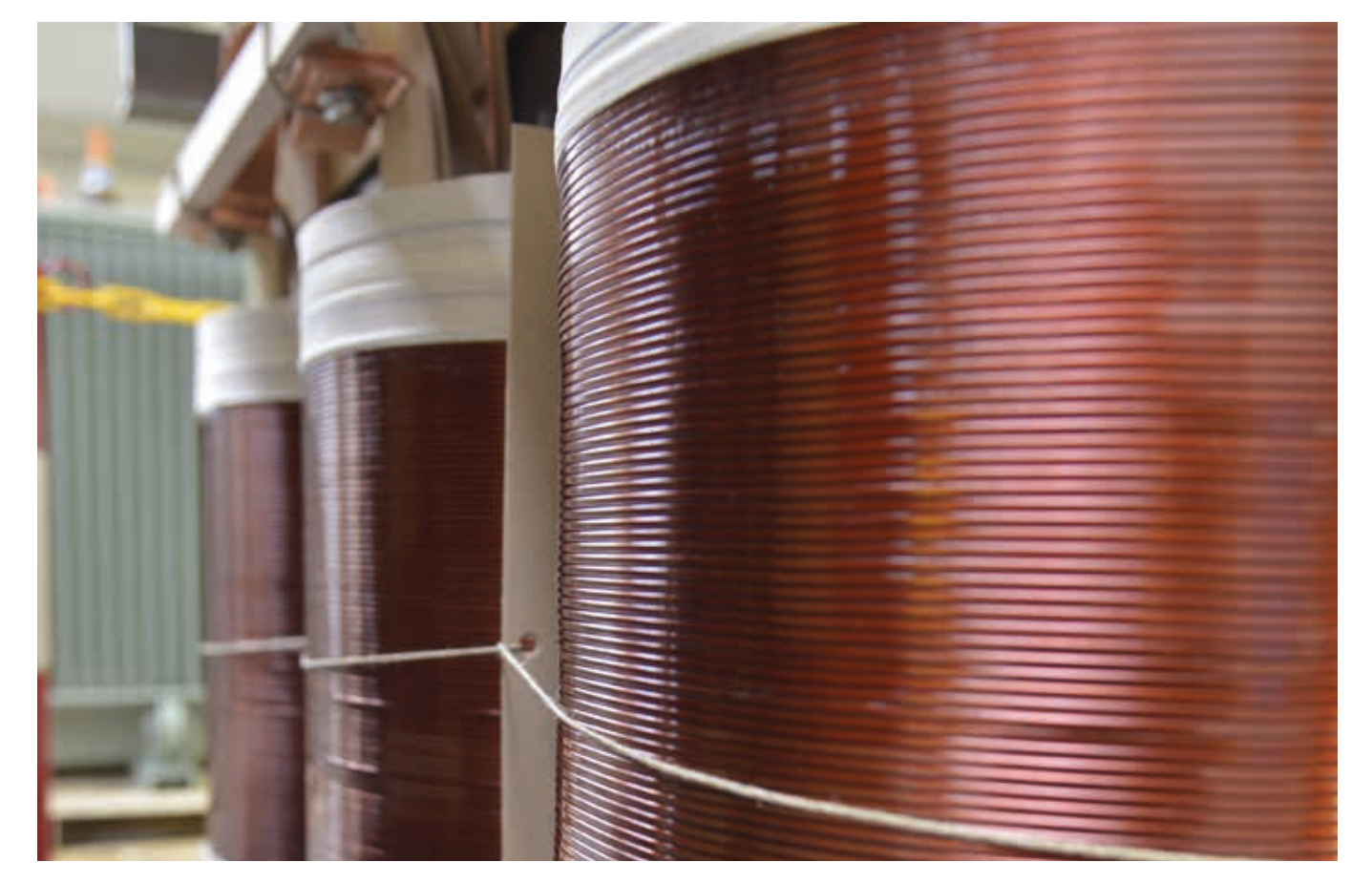
Our Windings - perfection in Detail

ا الحد 60076-1-5 100kVA – 10MVA up to 36kV 50 Hz (60Hz on request) - +/- 2 x 2.5% Dyn11 (others on request) AL or CU Low loss CRGO silicon steel According to IEC 60076-5 According to IEC 60076-7 Porcelain bushings, thermometer pocket, earthing terminals, off-load tap-changer, wheels